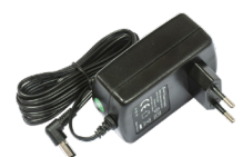
24 V 1.2 A power adapter included

IPsec hardware encryption (~470 Mbps) and The Dude server package is supported, microSD slot on it provides improved r/w speed for file storage and Dude.