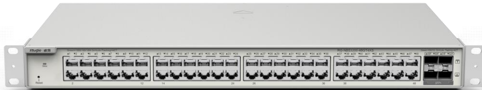
Fig 2 RG-NBS3200-48GT4XS / RG-NBS3200-48GT4XS-P