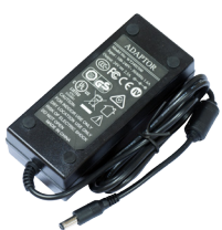
24V 2.5A Power adapter