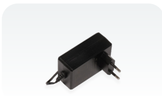
48 V 0.95 A power adapter