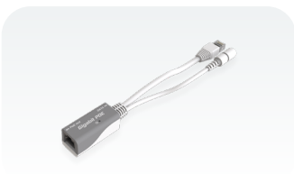
Gigabit PoE injector